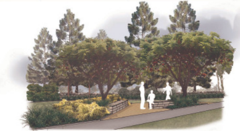
a parkland seating