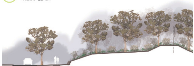
section 1 1:200 @ a1