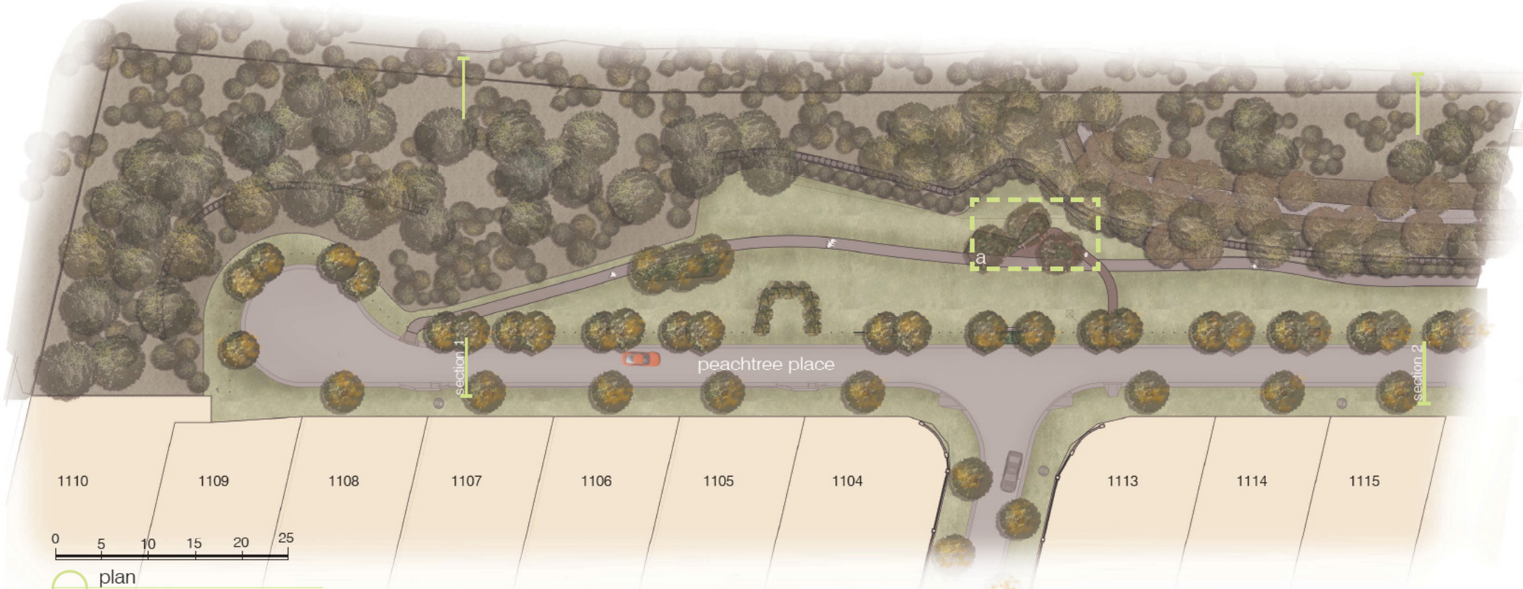
plan 1:250 @ a1