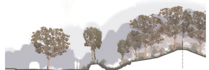
section 2 1:200 @ a1